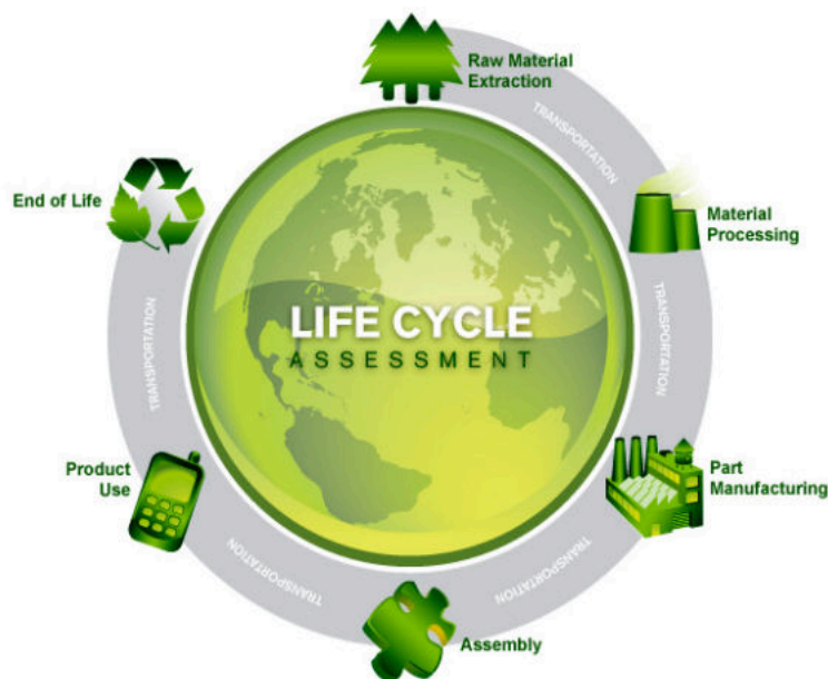
Fig.1. The scheme of a general Life Cycle Assessment

Life-cycle assessment (LCA, also known as life-cycle analysis, and cradle-to-grave analysis) is a method that enables to consider the environmental impacts associated with all the stages of a product's life. The term life cycle evokes/involves an holistic approach that requires the assessment of raw-material production, manufacture, distribution and disposal, including all the necessary transportation steps (Fig.1).